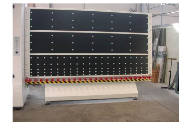
Optional hydraulic tilting table system